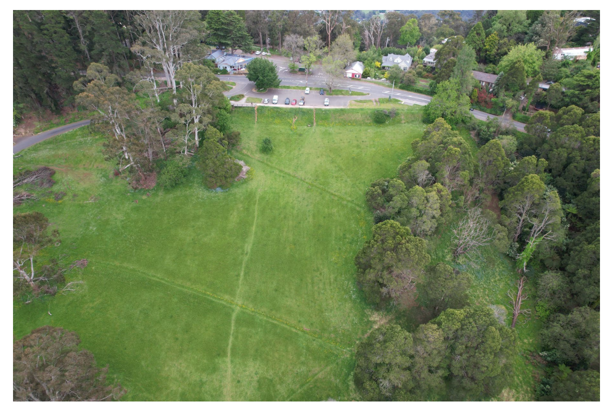
Existing Site – Kalorama Park