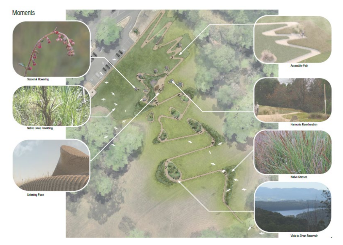
Proposed Site – Kalorama Park